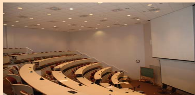
USA College of Medicine